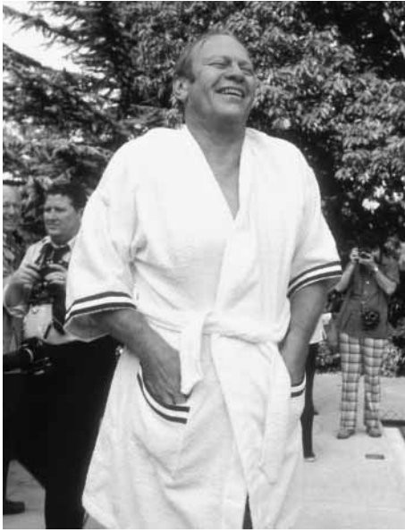
Everyone wanted to take pictures of President Ford swimming in the White House pool so one Sunday morning he invited us over to watch him swim.