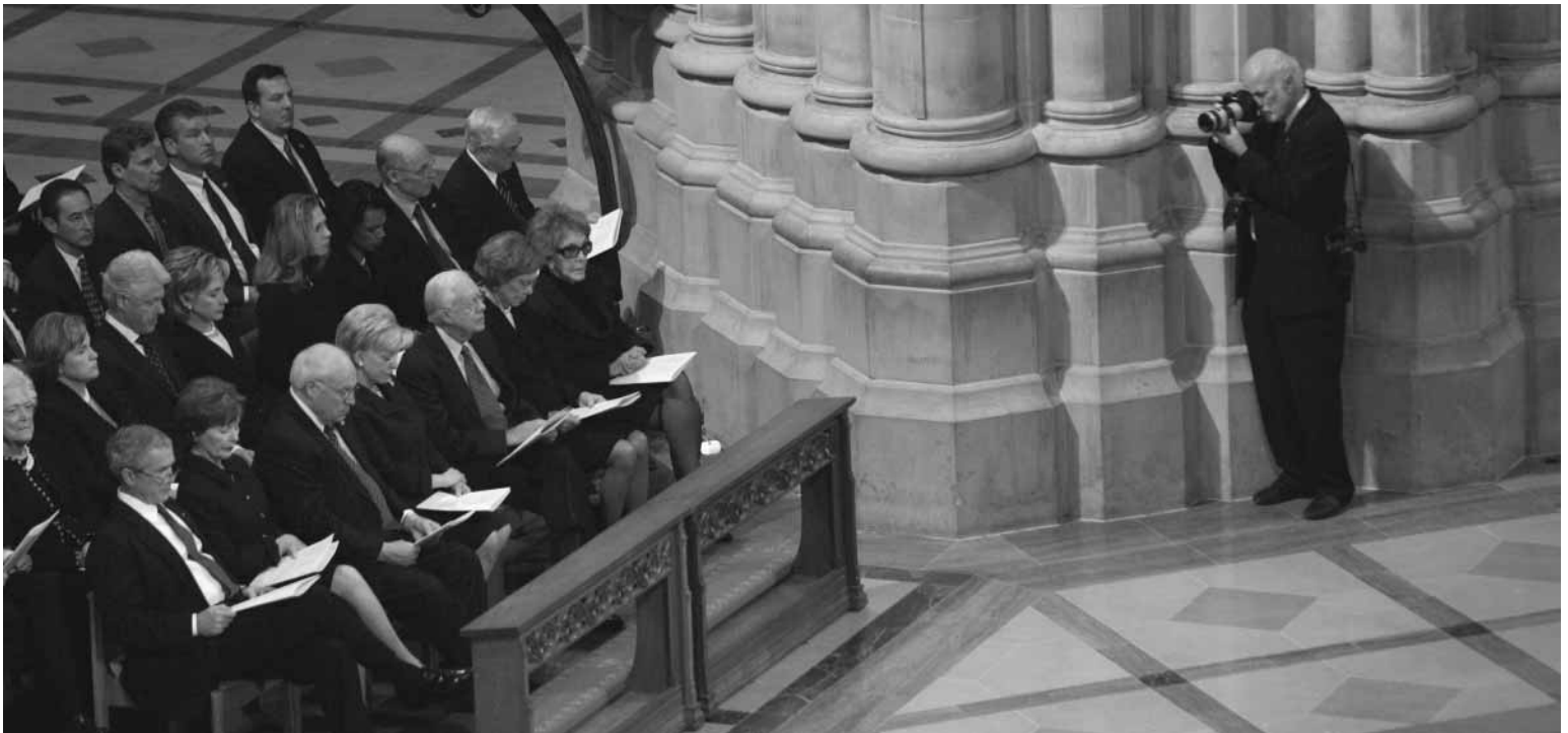
At the Washington National Cathedral WHNPA member David Hume Kennerly says farewell to his friend in his own way—recording the event in photographs.