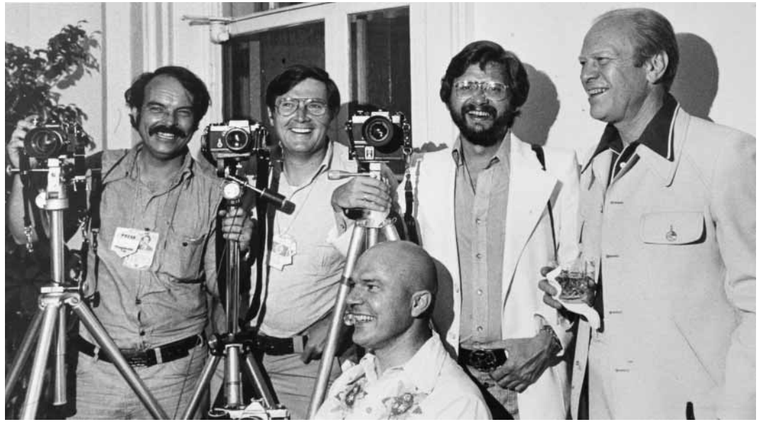
July 4th 1976 was the two hundredth anniversary of the United States and there was a mammoth fireworks display on the mall to celebrate. The pool envisioned a portrait of President and Mrs. Ford with a spectacular fireworks display as the background. One flash was on a light stand to the side and the plan was for one photographer to say